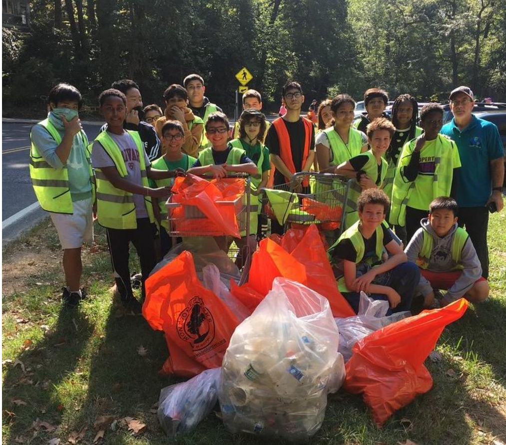
Students from Takoma Middle School show off their haul at the fall 2019 Sweep.