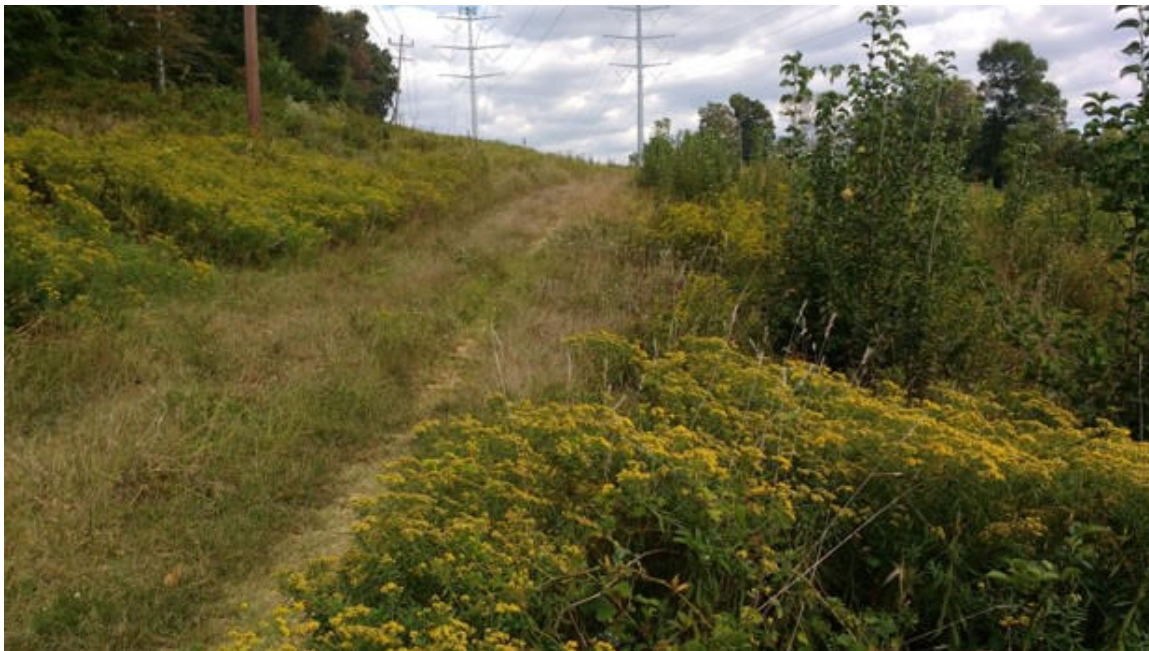
Footpath through the powerline meadow between New Hampshire Avenue and East West Highway