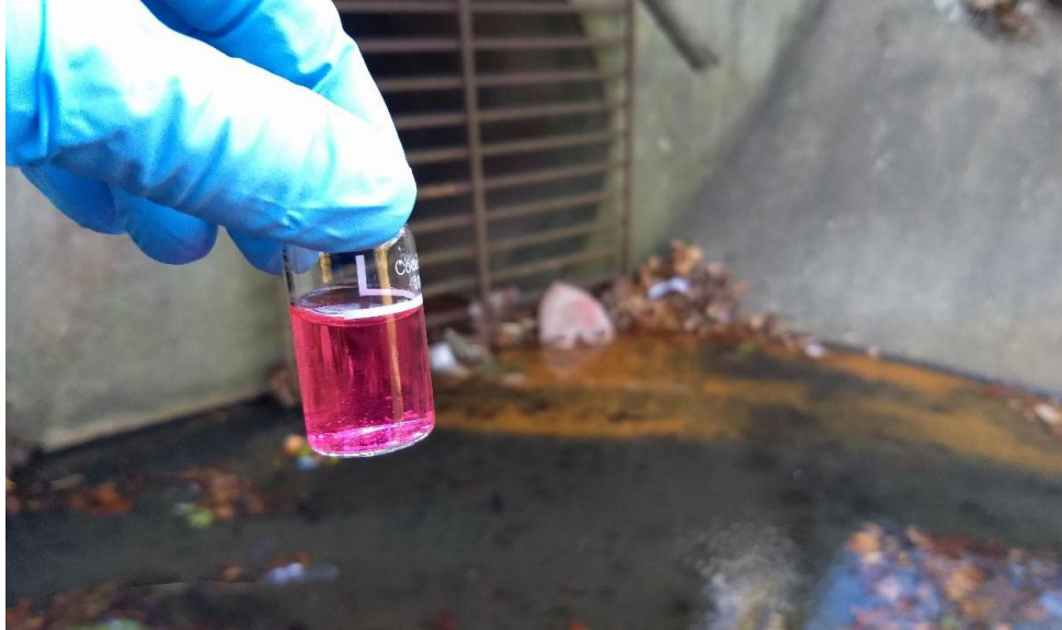
Test for chlorine being done by Pat Ratkowski of Friends of Sligo Creek at the Brashear's Run out-fall near Maple Avenue in 2017