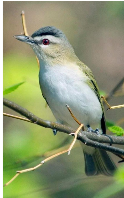
Eight Red-eyed Vireos were spotted on the outing.