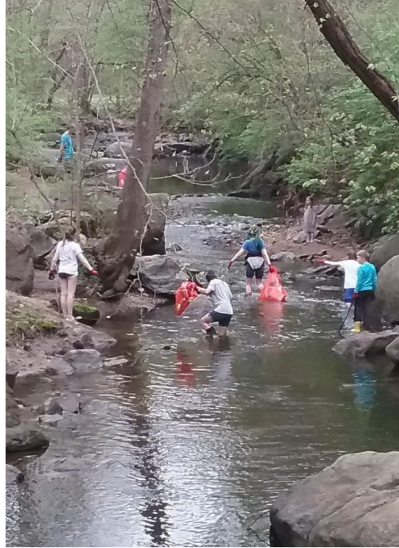
Volunteers wade into Sligo Creek to collect trash in 2019. (D. Clarkin photo)

For questions about the program contact Dee Clarkin at this email .